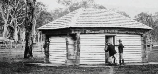
The Avenel bush lock-up where Red Kelly was incarcerated, serving 4 months of a 6 month sentence.