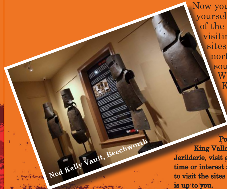
Ned Kelly Vault, Beechworth

Powers Lookout in the King Valley and the broad plains of Jerilderie, visit as many or as few sites as time or interest allows. There is no need to visit the sites in any order – the choice is up to you.